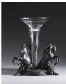
372 Angela Conner CELEBRATION, 2001 bronze with glass vase incorporated; (edition of 25) signed and numbered at the base 8.50 by 13in. (21.59 by 33.02cm) €400-€600 (£320-£480 approx)