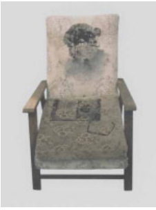
55 Tracey Staunton (b.1964) THE VANITY OF LIFE giclée print 25 by 19.50in. (63.50 by 49.53cm) €50-€80 (£40-£64 approx)