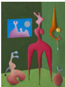
344 Desmond Morris (b.1928) GREEN ROOM, 2001 oil on board signed and dated lower left 18.50 by 14.75in. (46.99 by 37.47cm) €600-€800 (£480-£640 approx)

For a biography on this artist see www.whyt.es.ie