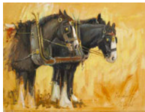
6 Henry McGrane (b.1969) MOYNALTY oil on board signed and titled lower right 14 by 18in. (35.56 by 45.72cm) €400-€600 (£320-£480 approx)