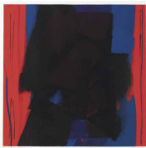
352 Martyn Brewster (b.1952) BEAUTY AND SADNESS, NO. 62, 1996 silkscreen monoprint signed, titled and dated 17 by 17in. (43.18 by 43.18cm) €150-€200 (£120-£160 approx)

More detailed information and larger illustrations on our website: www.whyt.es.ie