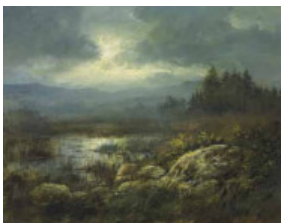
290 Joop Smits (Dutch, b.1938) LIGHT THROUGH BREAKING CLOUDS ON MARSH LANDS oil on canvas board signed lower right 19.50 by 25in. (49.53 by 63.50cm) €300-€500 (£240-£400 approx)