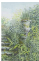
399 Jane de Vries A FORGOTTEN CORNER OF THE GARDEN [BANTRY HOUSE, CORK], 1989 watercolour over pencil signed lower left; with RHA exhibition label on reverse 8 by 5.25in. (20.32 by 13.34cm) €150-€250 (£120-£200 approx)