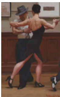
394 Andrew Fitzpatrick (Scottish, b.1966) TANGO COUPLE II, c.2004 oil on canvas signed lower right 11.50 by 7.50in. (29.21 by 19.05cm) €150-€250 (£120-£200 approx)