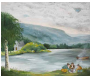
259 John Schwatschke (b.1943) BREAK AT GOUGANE BARRA, CO. CORK, 2004 oil on canvas signed in monogram and dated [4 June] upper left 30 by 36in. (76.20 by 91.44cm) €1,000-€1,500 (£800-£1,200 approx)