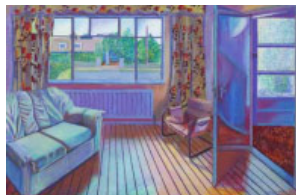
355 Mary Burke (b.1959) ARDAGH PARK INTERIOR, 1989 oil pastel on board signed and dated lower right 20.50 by 31.50in. (52.07 by 80.01cm) €300-€400 (£240-£320 approx)