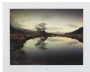
16 Eoghan Kavanagh TREE LAKE, CO. KERRY digital print on archival paper (no. 58 from an edition of 100) signed, numbered and titled 11.75 by 15.50in. (29.85 by 39.37cm) €100-€150 (£80-£120 approx)