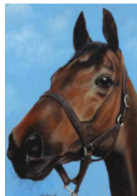
7 John Fitzgerald RED RUM oil on canvas signed lower left; titled on reverse 21.50 by 15.50in. (54.61 by 39.37cm) €500-€700 (£400-£560 approx)