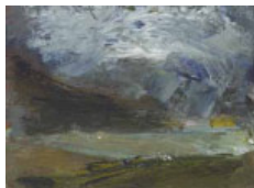
288 Melita Denaro (b.1950) STORM OVER THE MUIR BHEALACH [DOAGH, CO. DONEGAL] oil on board signed and inscribed on reverse 6 by 8.25in. (15.24 by 20.96cm) €400-€500 (£320-£400 approx)