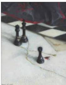
19 James English RHA (b.1946) THE KING AND QUEEN oil on canvas laid on board signed lower left 12 by 10in. (30.48 by 25.40cm) €400-€600 (£320-£480 approx)