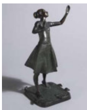
117 Andrzej Szczepaniec (Polish, b.1947) DANCER, 1990 bronze signed and dated at the base 7.50 by 5 by 3.50in. (19.05 by 12.70 by 8.89cm) €300-€500 (£240-£400 approx)