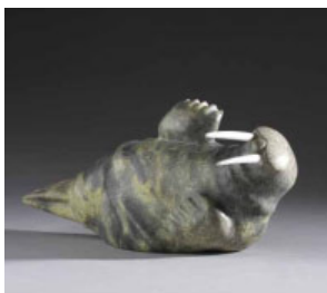
119 Inuit School WALRUS (#1641) carving in green marble with bone 7 by 18 by 11.50in. (17.78 by 45.72 by 29.21cm) €500-€700 (£400-£560 approx)