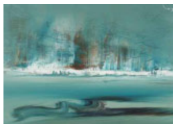
13 John Hurley ATLANTIC SURF oil on board signed lower left 14 by 20in. (35.56 by 50.80cm) €500-€700 (£400-£560 approx)