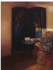
18 Rose Stapleton WCSI (b.1951) ESTHER'S SCREEN AT SELLERNAUN oil on canvas board signed lower right 20 by 16in. (50.80 by 40.64cm) €800-€1,200 (£640-£960 approx)