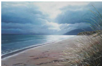
10 Jane Hilliard MORNING LIGHT oil on canvas board signed lower left; titled on reverse 19.50 by 29.50in. (49.53 by 74.93cm) €800-€1,000 (£640-£800 approx)