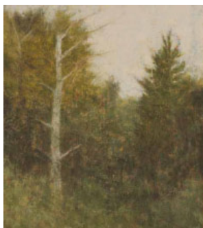
353 Keith Wilson RUA (b.1971) TIME TO THINK III, 2006 oil on canvas signed lower right 14.50 by 12.50in. (36.83 by 31.75cm) €800-€1,200 (£640-£960 approx)