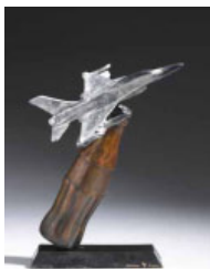
284 David Dunne THE REAL THING, 2007 bronze; (2/8) signed, numbered & dated 9.50 by 7.50 by 4in. (24.13 by 19.05 by 10.16cm) €500-€700 (£400-£560 approx)