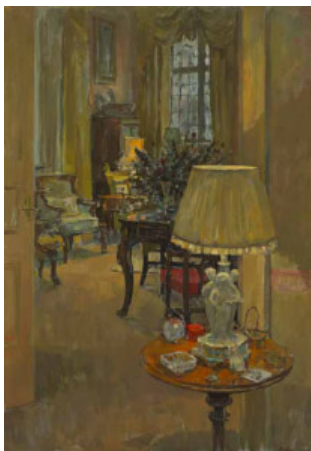
17 Susan Ryder VPRP NEAC THE CUPID LAMP oil on canvas signed lower right 36 by 25in. (91.44 by 63.50cm) €1,500-€2,000 (£1,200-£1,600 approx)