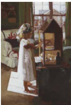
20 Rowland Davidson (b.1942) THE DOLL'S HOUSE oil on canvas signed lower right 18 by 13in. (45.72 by 33.02cm) €700-€900 (£560-£720 approx)