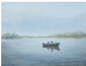
380 Pearse Ward MORNING ON THE LAKE, 1996 watercolour signed lower left 9.75 by 12.75in. (24.77 by 32.39cm) €200-€300 (£160-£240 approx)