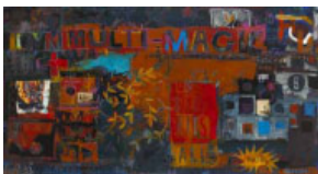
294 David Quinn (b.1971) MULTIMAGIC oil with collage on board 40 by 79.50in. (101.60 by 201.93cm) €150-€200 (£120-£160 approx)