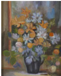
396 Benita Johnson A BREATH OF SPRING, 1989 oil on canvas board signed lower right; with inscribed RHA exhibition label on reverse 10 by 8in. (25.40 by 20.32cm) €300-€300 (£160-£240 approx)