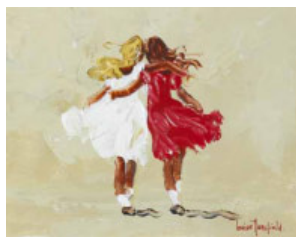
11 Louise Mansfield (b.1950) PALS acrylic on canvas board signed lower right 7.50 by 9.50in. (19.05 by 24.13cm) An exhibition catalogue illustrating the present work accompanies this lot. €400-€600 (£320-£480 approx)

More detailed information and larger illustrations on our website: www.whyes.ie