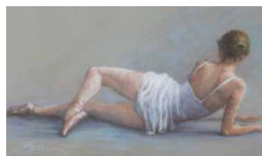
397 Ann Gallagher RECLINING DANCER, 1995 pastel on buff-coloured paper signed and dated lower left; with title on reverse 8 by 13in. (20.32 by 33.02cm) €150-€250 (£120-£200 approx)