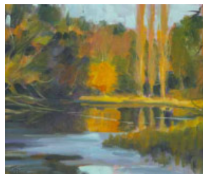
14 Norman Teeling (b.1944) AUTUMN, THE FURRY GLEN, DUBLIN, 2012 oil on board signed lower left 10 by 12in. (25.40 by 30.48cm) €300-€500 (£240-£400 approx)