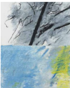
348 Robert Janz (b.1932) LINESTORM, 5 APRIL 1987 oil stick on paper signed, titled and dated 30 by 22.25in. (76.20 by 56.52cm) €200-€300 (£160-£240 approx)