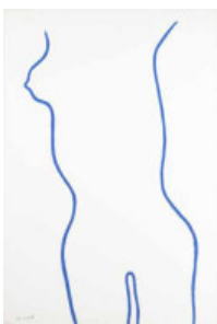
121 William Scott CBE RA (1913-1989) A GIRL SURVEYED, 1971 screen print; (19/75) signed and numbered lower left 31.75 by 21.50in. (80.65 by 54.61cm) €600-€800 (£480-£640 approx)