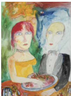
258 John Bellany CBE RA (b.1942) DINNER AT DROMOLAND CASTLE watercolour over pencil on paper signed upper left; titled upper right 30 by 22.50in. (76.20 by 57.15cm) €400-€500 (£320-£400 approx)