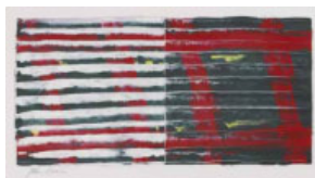
293 John Cronin (b.1966) UNTITLED [WHITE STRIPES ON BLACK] acrylic on paper signed 17.50 by 36in. (44.45 by 91.44cm) €200-€300 (£160-£240 approx)