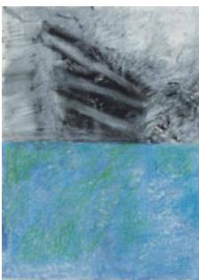
349 Robert Janz (b.1932) LINESTORM, 30 AUGUST 1987 oil stick on paper signed, titled and dated 26 by 19in. (66.04 by 48.26cm) €200-€300 (£160-£240 approx)