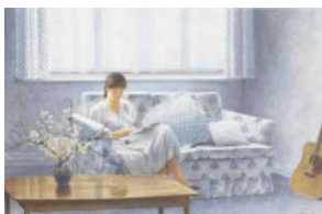
373 Joe Dunne ARHA (b.1957) AUTUMN AFTERNOON, 1990 tempera on board signed and dated lower right 11.50 by 17.50in. (29.21 by 44.45cm) €800-€1,200 (£640-£960 approx)