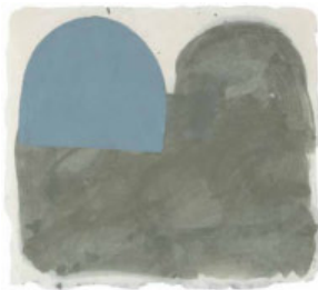
350 Richard Gorman RHA (b.1946) UNTITLED watercolour with gouache on Japanese paper signed with initials lower right 10 by 11in. (25.40 by 27.94cm) €300-€500 (£240-£400 approx)