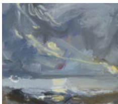
289 Melita Denaro (b.1950) MOONLIGHT LANDSCAPE oil on board signed and titled on reverse 6.50 by 7.50in. (16.51 by 19.05cm) €400-€500 (£320-£400 approx)