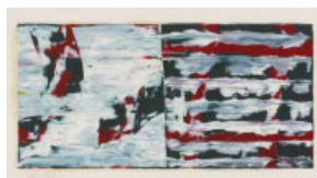
291 John Cronin (b.1966) UNTITLED [RED STRIPES ON WHITE] acrylic on paper signed in pencil 17.50 by 36in. (44.45 by 91.44cm) €200-€300 (£160-£240 approx)