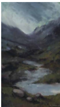
375 Richard Hearn THE GREAT EPIC oil on canvas signed lower right 27 by 15.50in. (68.58 by 39.37cm) €500-€700 (£400-£560 approx)