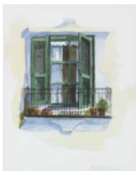
395 Gretta O'Brien (b.1933) SIESTA watercolour over pencil signed lower right 11 by 9in. (27.94 by 22.86cm) €100-€150 (£80-£120 approx)