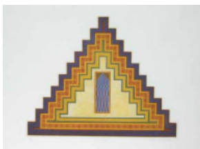
357 Michael Paul Burnett ZIGGURAT, 1974 colour etching; (2/25) signed, titled, dated & numbered 22 by 29.75in. (55.88 by 75.57cm) €150-€250 (£120-£200 approx)