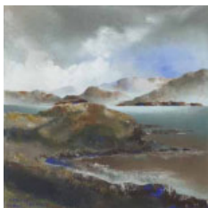
9 Claudio Viscardi MOODS OF BEARA II oil on canvas signed and dated lower left 10 by 9.75in. (25.40 by 24.77cm) €300-€500 (£240-£400 approx)