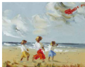
15 Thelma Mansfield (b.1949) CHILDREN WITH A RED KITE oil on canvas board signed lower right 7.50 by 9.50in. (19.05 by 24.13cm) €400-€600 (£320-£480 approx)