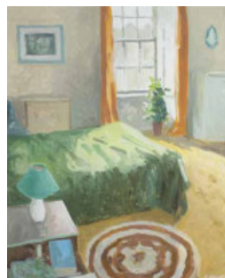
398 Simon Macleod (b.1956) INTERIOR, 1991 oil on canvas signed lower right 24 by 20in. (60.96 by 50.80cm) €150-€250 (£120-£200 approx)