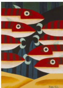
255 Graham Knuttel (b.1954) RED FISH oil on canvas signed lower right 14 by 10in. (35.56 by 25.40cm) €800-€1,000 (£640-£800 approx)