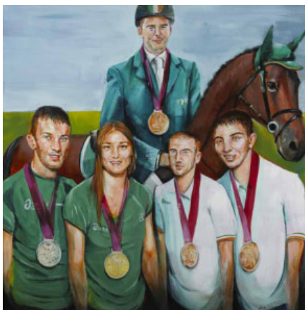
4 Tom Byrne (b.1962) OLYMPICS MEDALISTS, 2012 oil on canvas signed lower right; titled on reverse 39.50 by 39.50in. (100.33 by 100.33cm) €1,000-€1,500 (£800-£1,200 approx)