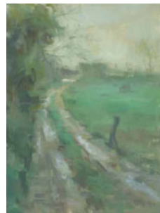
24 Paul Kelly (b.1968) Misty Lane, 1990 oil on canvas signed and dated lower right 16 by 12in. (40.64 by 30.48cm) €700-€900 (£560-£720 approx)