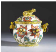
124 Ardmore China (South Africa) LEOPARD TUREEN, 2003 ceramic signed beneath the base 12 by 12 by 12in. (30.48 by 30.48 by 30.48cm) €300-€400 (£240-£320 approx)