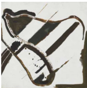
356 Anthony Malin (d.2005) DREAM, 1974 tempera on canvas laid on board signed lower right; inscribed on reverse 8 by 8in. (20.32 by 20.32cm) €200-€300 (£160-£240 approx)