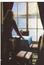
374 Mike Briscoe (b.1960) STUDY AT THE GRAND I, 2003 oil on linen signed and dated on reverse 14 by 10in. (35.56 by 25.40cm) €300-€400 (£240-£320 approx)