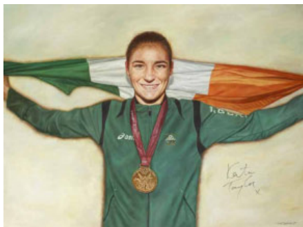
3 Mark Barker (b.1986) PORTRAIT OF KATIE TAYLOR, 2012 oil on canvas signed by the artist and the sitter 30 by 40in. (76.20 by 101.60cm) €1,000-€1,500 (£800-£1,200 approx)