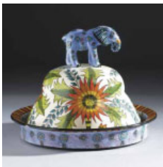
125 Ardmore China (South Africa) BUTTER DISH, ELEPHANT, 2003 ceramic signed beneath base 11.50 by 12 by 12in. (29.21 by 30.48 by 30.48cm) €300-€400 (£240-£320 approx)