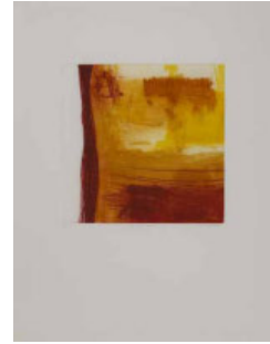
65 Mary Fitzgerald (b.1956) THE SCARLET CORD etching, drypoint and carborundum 11.50 by 11.50in. (29.21 by 29.21cm) €50-€80 (£40-£64 approx)