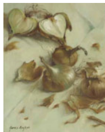
22 James English RHA (b.1946) ONION PEELS oil on canvas signed lower left; titled on reverse 12 by 10in. (30.48 by 25.40cm) €300-€500 (£240-£400 approx)